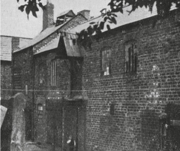
The Cotton Room